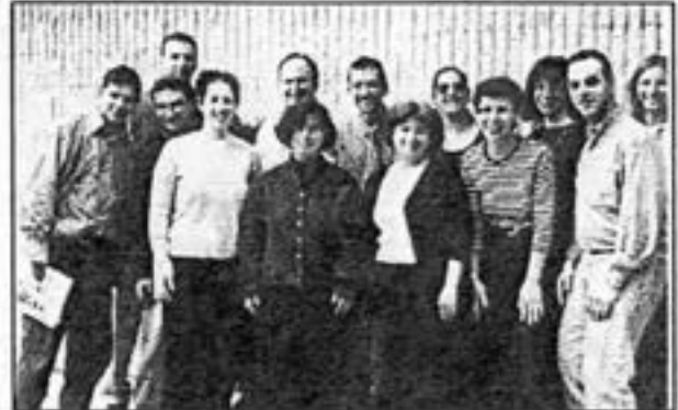
Religious School Faculty

On behalf of the faculty and school, I would like to thank the parents for all your support and, most especially, for giving us the pleasure of working with your children.