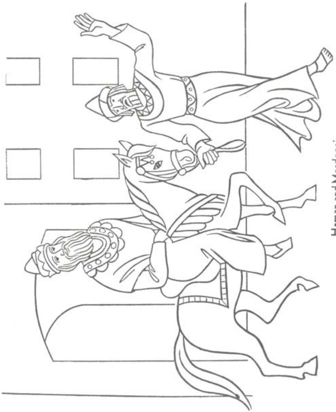
Haman and Mordecai