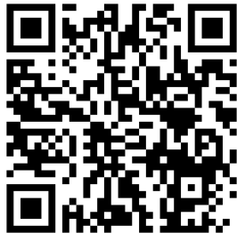
Scan to view board photos