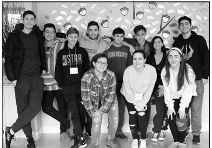
Our USY kids