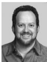
CBT Men's Club Man of the Year