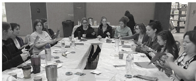
Cutting and ribbon making social action project for the North Brunswick Domestic Violence Response Team