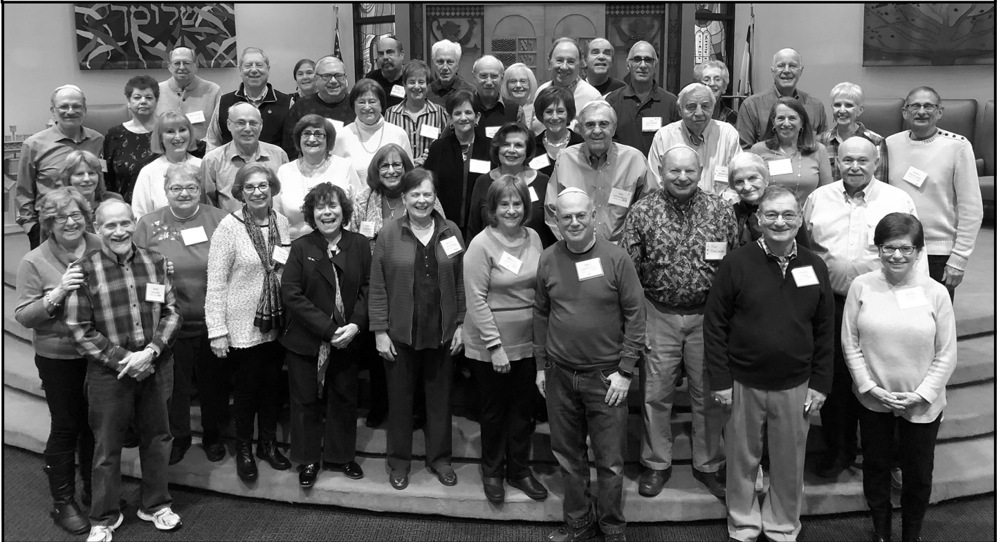
Photo of founding members at the 40th Anniversary Brunch on Sunday, January 28

Our Founding Members would love to see you at the Gala on March 24th.