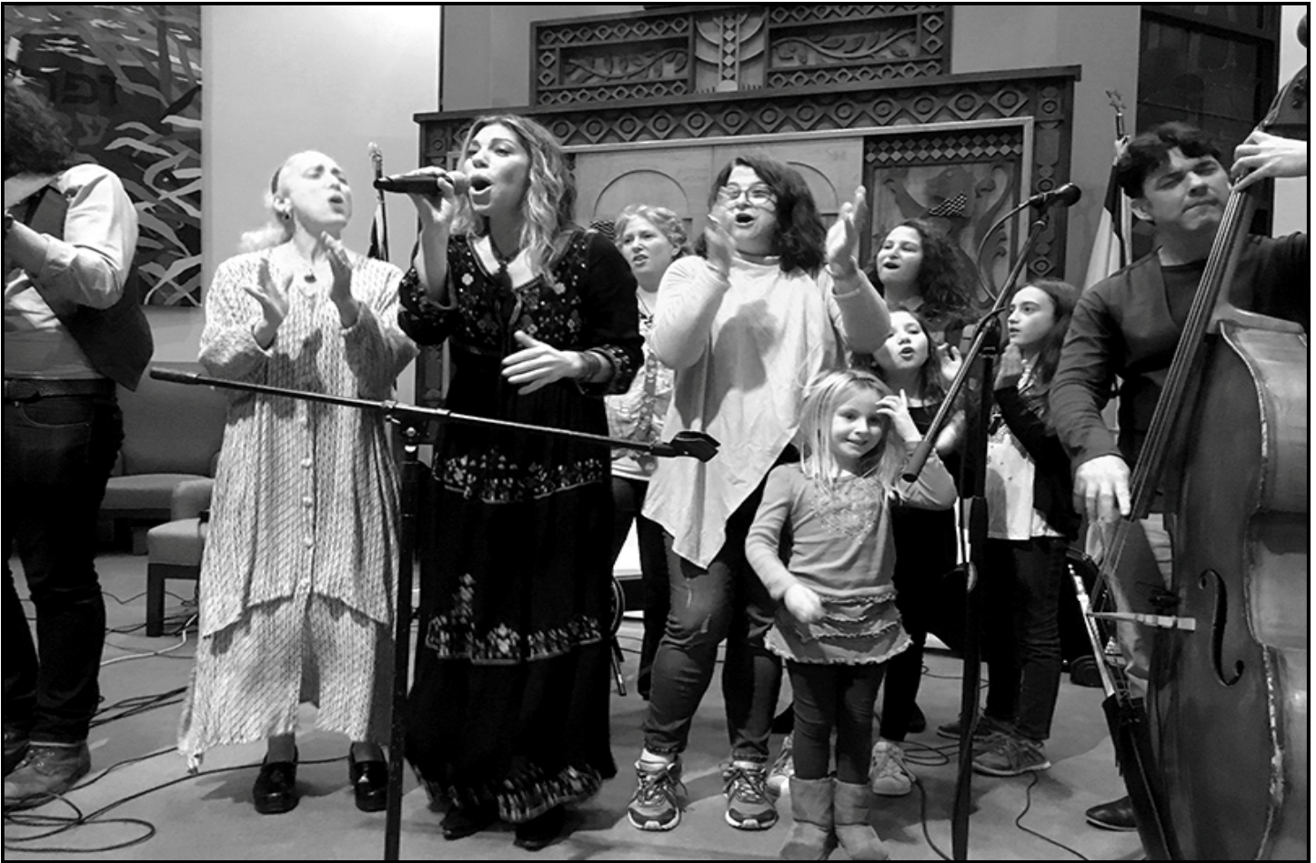
Nefesh Mountain performed at CBT to a packed house on December 3rd with "back-up singers" from the congregation and lots of audience participation.