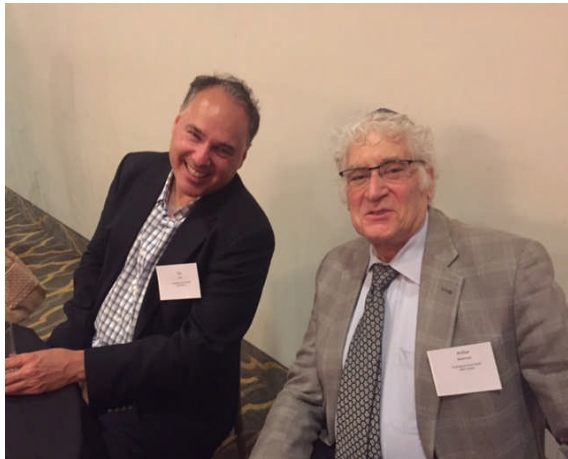
CBT Men's Club Man and Youth of the Year 2017