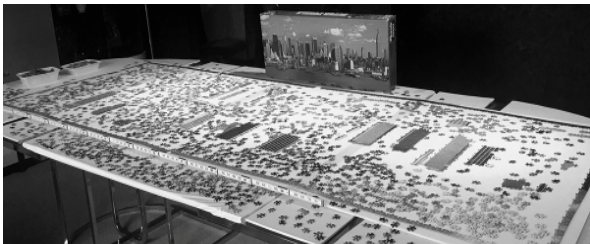
Gary & Bobby Bergman

We moved the puzzle to our house where we set up a 10-foot table in our living room to accommodate a dozen or so people at once. We enjoy having people in our home, so don't feel as if you're imposing "and refreshments are always on hand". But, please, call or text to 732-247-2727 to ensure someone is here to let you in. We'd like to see this puzzle completed before 2019, so our living room can revert back to serving no particular purpose.