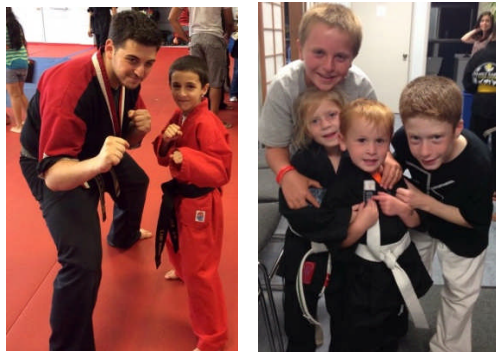
TAE KWON DO AGES 4 & UP