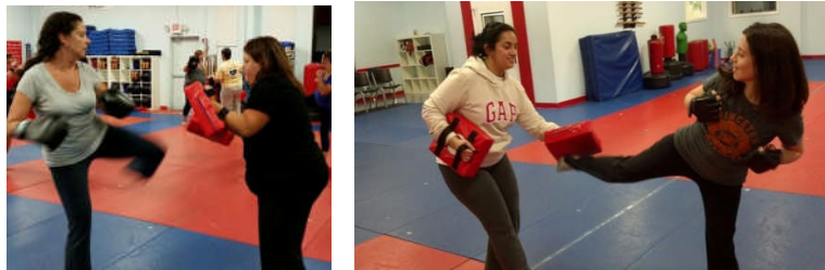
KICKBOXING FOR KIDS AND ADULTS