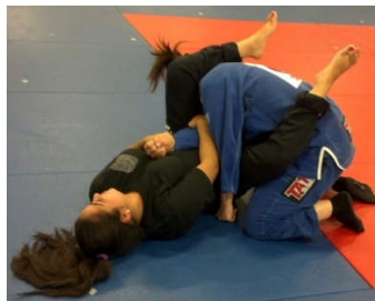
BRAZILIAN JIU JITSU

AND OUR BRAND NEW SUNDAY MORNING YOGA CLASS!