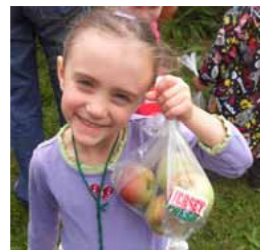
Giamarese Farm Trip