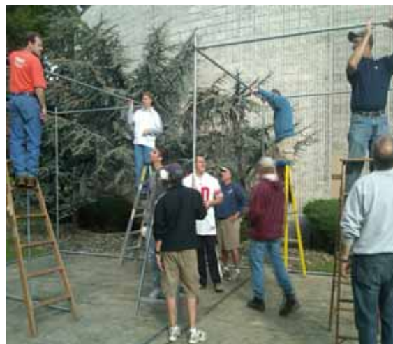
Putting up the Sukkah