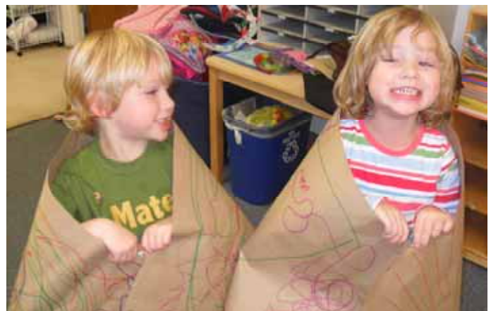
Passport to Adventure Eating Tacos in Mexico Wearing Serapes