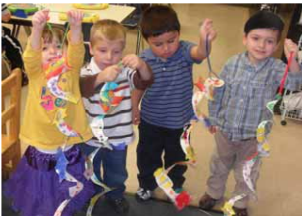
Look at our Sukkah Decorations

Thank you for supporting our Nursery School!