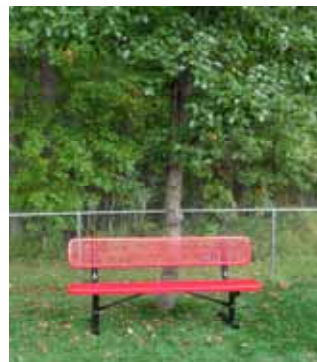
Our new bench