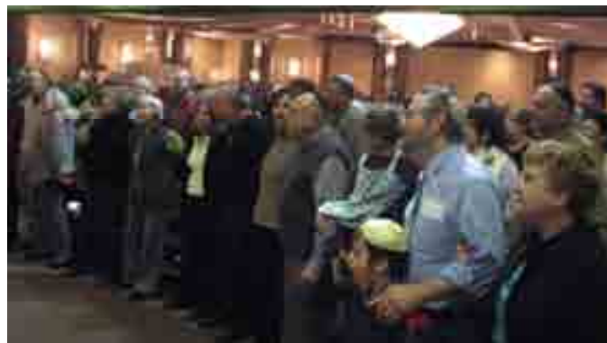
Debbie Friedman in Concert 2009