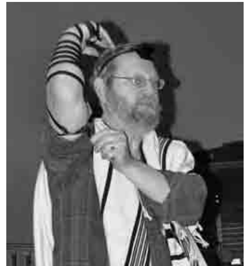
Wrap images on pages 17 and 21