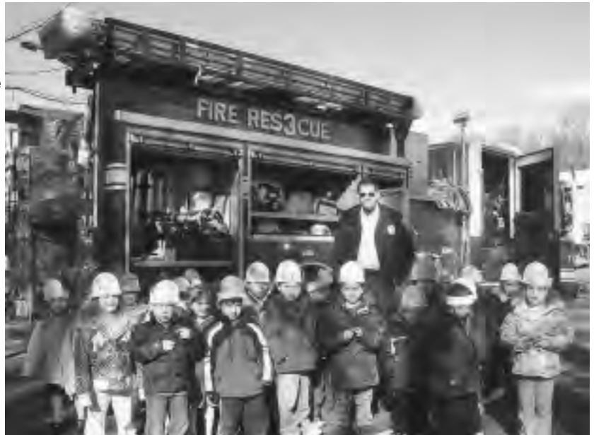
The B'nai Tikvah Nursery School Gets a first hand look at the trucks and cars that serve our communities.